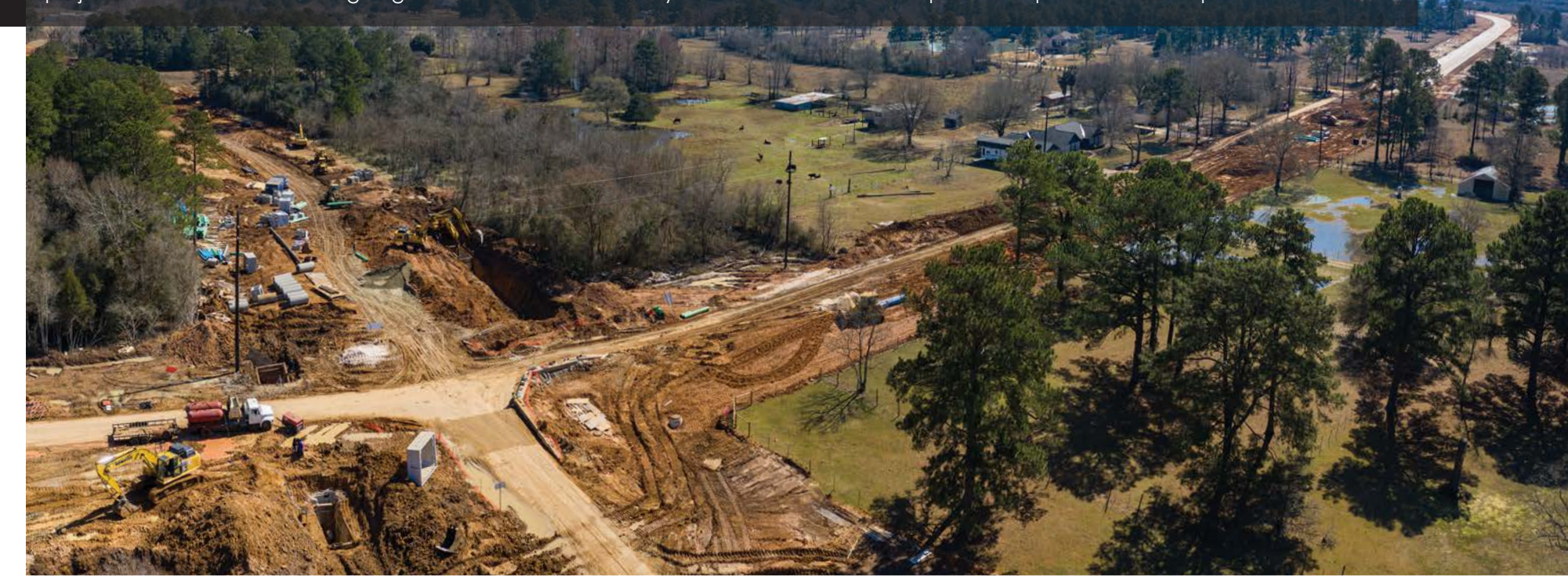
South Persimmon Street / Medical Complex Drive Extension

Also included is a four-lane extension of Medical Complex Drive from South Persimmon to connect with Hufsmith-Kohrville Road. The project underscores TEDC's ongoing collaboration with the City. The new roads are anticipated to open in the third quarter of 2021.